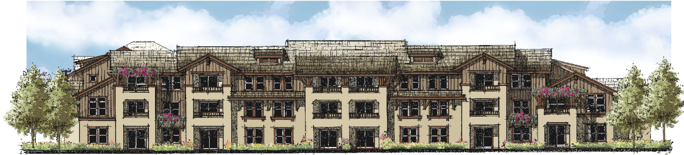
FRONT EXTERIOR ELEVATION