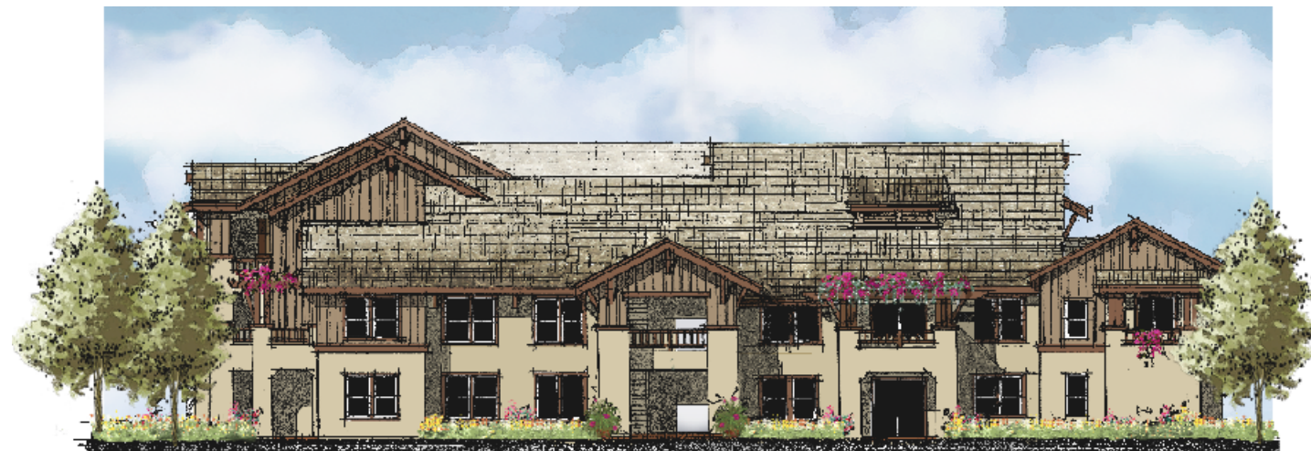
RIGHT SIDE EXTERIOR ELEVATION