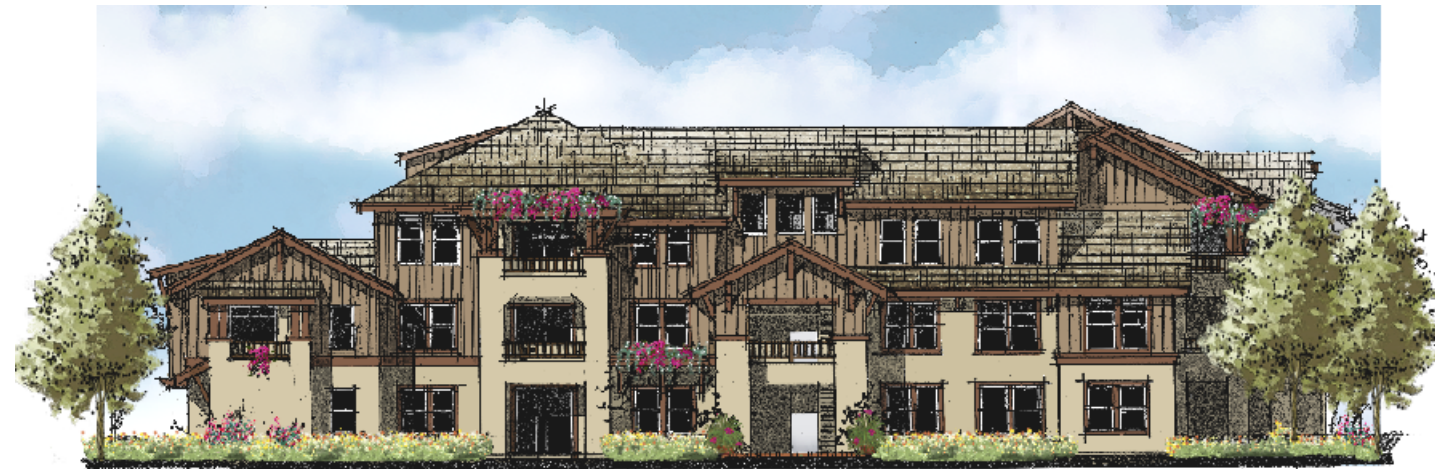
LEFT SIDE EXTERIOR ELEVATION